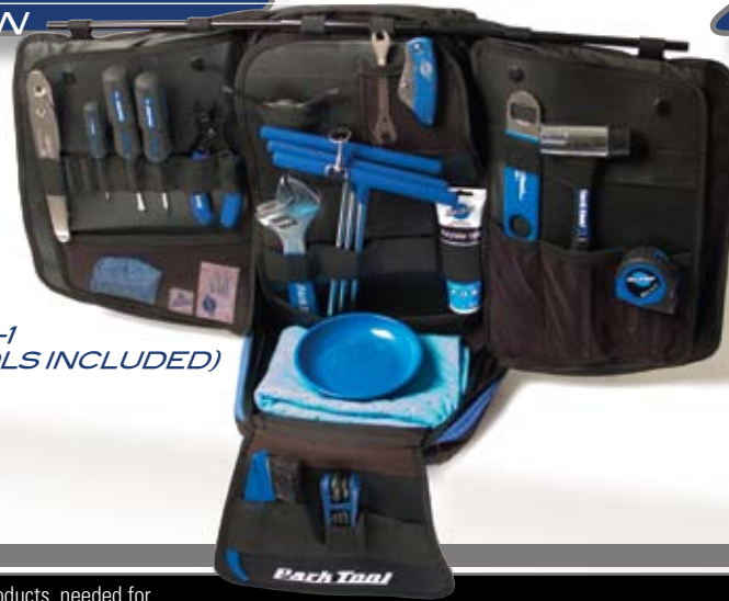
MRK-1 (TOOLS INCLUDED)