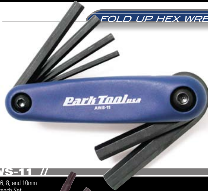
AWS-11 // 3, 4, 5, 6, 8, and 10mm Hex Wrench Set.