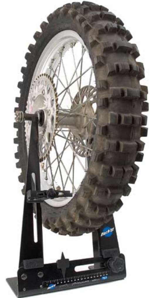
WHEEL TRUING STAND

The Park Tool Handlebar and Subframe Straightener is a versatile and productive tool. The open hook design enables it to straighten handlebars and subframes. Vinyl coating on the hook and on the fulcrum pad protects painted surfaces. The hook has over 8" of adjustment.