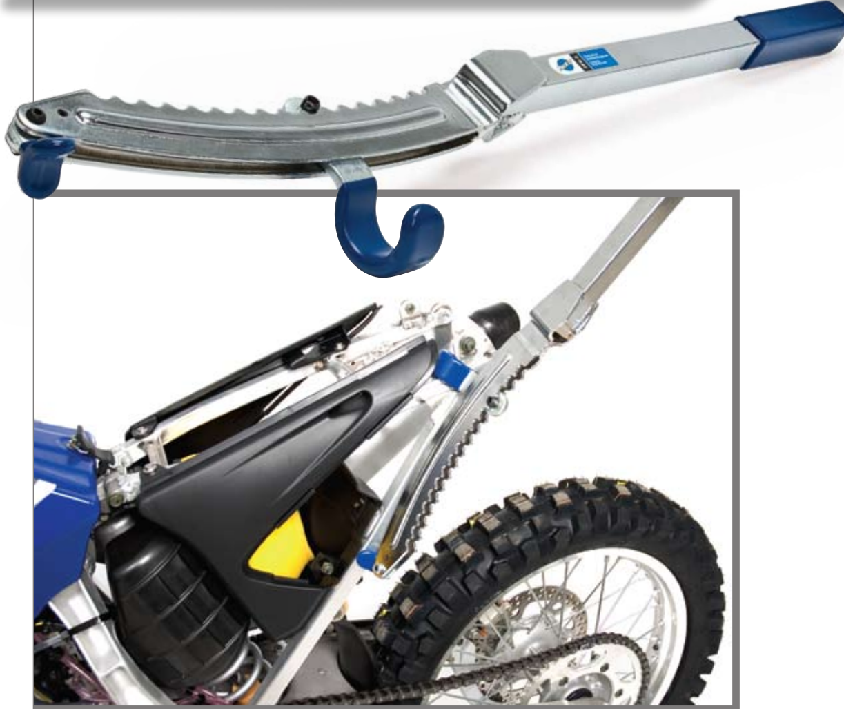
HANDLEBAR AND SUBFRAME STRAIGHTENER