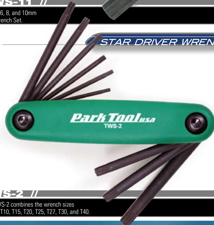
TWS-2 // The TWS-2 combines the wrench sizes T7, T9, T10, T15, T20, T25, T27, T30, and T40.