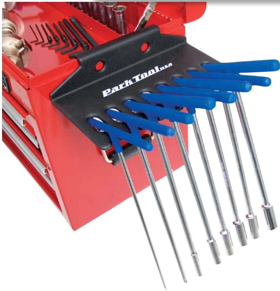
TH-1H (WITH HOLDER) // TH-1 (WITHOUT HOLDER)

Easy-Grip PVC dipped handles for comfort and stability. Precision fit, inertia welded deep sockets for nearly all applications. Set includes #2 & #3 Phillips head screwdrivers, 8, 10, 12, 13, 14, and 17mm deep sockets. Optional vinyl dipped holding rack solidly holds and organizes T-handles. Hangs firmly on Park Tool cast aluminum tool trays, most steel toolboxes, or bolts to any wall or tool board (fasteners not included).