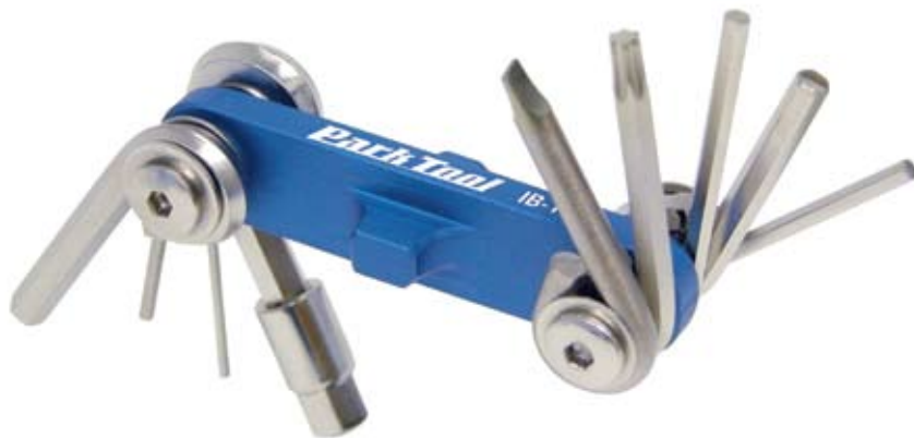
IB-2 // Perfect for the road or trail, the IB-2 packs all the essentials: 1.5, 2, 2.5, 3, 4, 5, 6, and 8mm hex wrenches as well as a straight blade screwdriver and a T25 Star driver wrench. (laser engraving available)