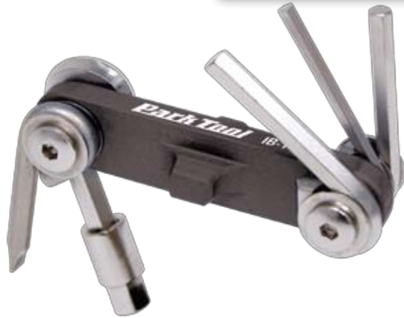
IB-1 // Small and lightweight, the IB-1 features our unique forged aluminum I-Beam handle surrounded by the basics: 3, 4, 5, 6, and 8mm hex wrenches and straight blade screwdriver. (laser engraving available)