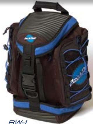
BW-1 (BACKPACK ONLY)