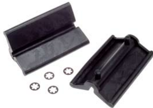
1002 // REPLACEMENT JAW COVER

Permanently and securely attach your PRS-3M to the floor. 8" square steel plate includes stand mounting bolts. (floor mounting bolts not included).